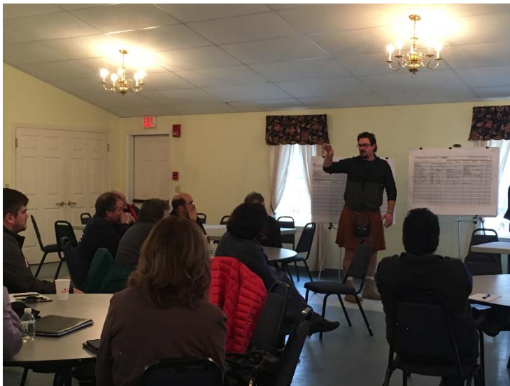
Risk matrices and maps (pictured here) were used to track strengths and vulnerabilities in Rochester. Each item listed in a risk matrix corresponds to a dot on the map.

Forestry Health speaks to the specific hazards posed by Rochester’s ubiquitous forest lands, which, though also a critical aspect of the culture and identity in town, have increasingly come under threat from the three previous hazards identified here. Invasive pests are causing major die-off, an exacerbated flood-drought cycle is weakening root structures and harming tree health, and stronger, more frequent storms have come together with these other factors to increase both the rate of tree fall and the severity of associated impacts. Protecting and enhancing Rochester’s forests is an important community value that will help to preserve the rural character of the town that residents cherish so deeply.