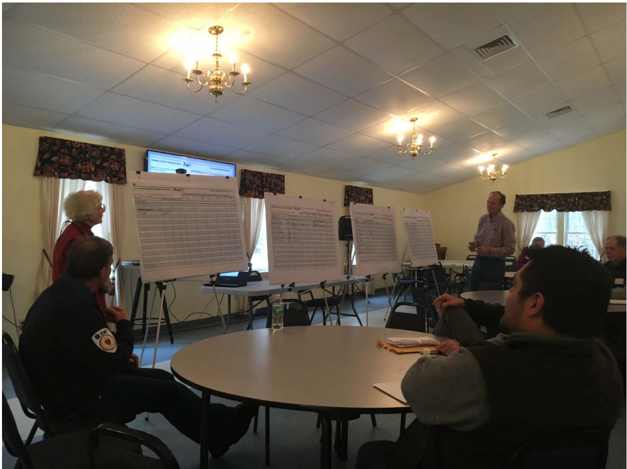
Workshop participants present their completed risk matrices, including top hazards, strengths, vulnerabilities, and action items.

Rochester residents were well acquainted with the many strengths their town can leverage to manage risks posed by natural hazards. Supporting and enhancing existing strengths and assets into the future will complement newly-identified strategies to address vulnerabilities, further helping to build local resilience. The following strengths and assets were identified as essential for adapting to the impacts of a severe flood/drought cycle , pests (vectors, invasive species), storms/strong winds , and forestry health :