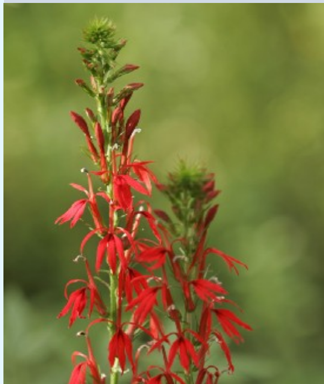
Cardinal flower, Lobelia cardinalis , is common along streams in the Taunton River watershed.

The project will cost about $938,000 and will be funded with grants from the Open Rivers Initiative of the National Oceanic and Atmospheric Administration, American Rivers, and other sources.