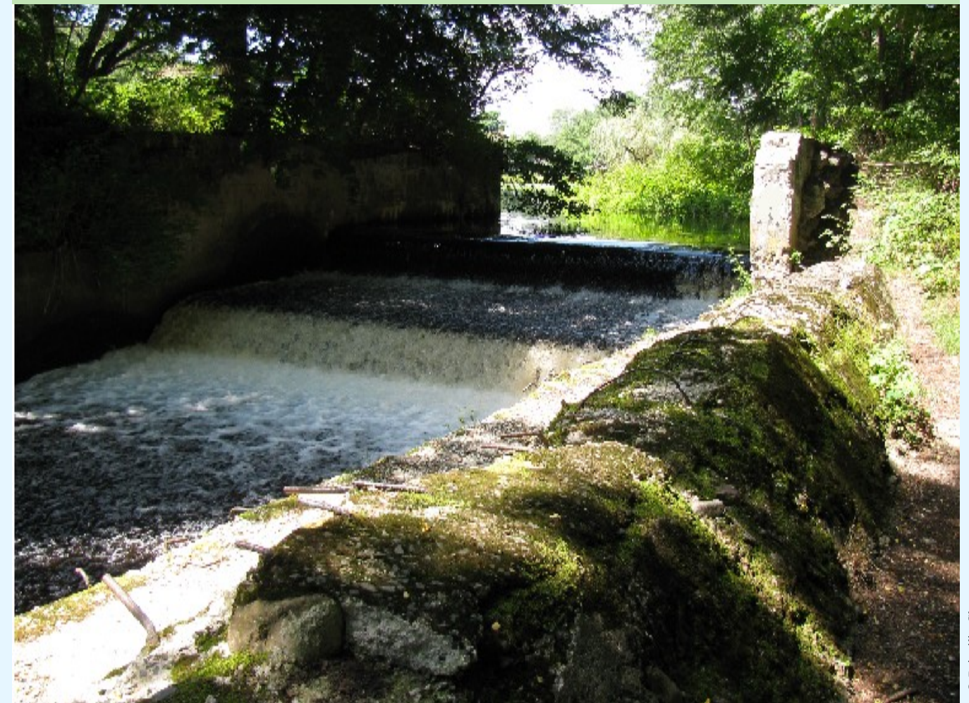
State Hospital dam is the first dam on the Mill River.

The Massachusetts Department of Mental Health (DMH), working in conjunction with the Massachusetts Division of Ecological Restoration (DER), plans to remove the State Hospital dam. This project is the first step in a larger plan to restore the Mill River, an effort that will restore free-flowing water from the confluence of the Mill and Taunton rivers (about 2.7 miles downstream of the dam) up to Lake Sabbatia. It will return fish, plants, and animals to the Mill River.