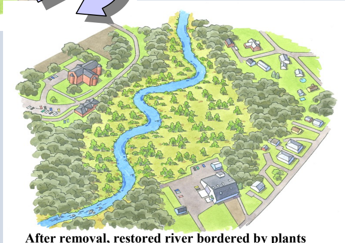
After removal, restored river bordered by plants

Natural flowing rivers bend and wind in channels that follow the surrounding terrain. Many have floodplains that hold floodwaters from major storms. Flowing water picks up oxygen and releases heat, and it carries sand, silt, gravel and cobbles downstream.