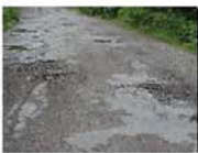
POINT 2: QUEEN GUTTER BROOK ROAD CROSS SECTION

The GRRIP I (Geographic Roadway Runoff Inventory Program) is an analysis of roadway drainage facilities located in environmentally sensitive areas on defined Federal Aid Eligible Roads. GRRIP I analyzed towns in the SRPEDD region that fell within the Buzzards Bay Watershed. The Watershed Analysis Project further details several of the drainage systems within each of the towns in the Buzzards Bay Watershed to show the general health of the contributing watershed from the specified drainage system by extrapolating its area of imperviousness using the Schuler Watershed Methodology and the Watershed Tools Extension developed by Mass GIS.