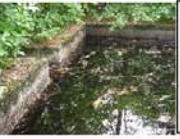
POINT 1: QUEEN GUTTER BROOK ROUGH CROSS SECTION ON ROADWAY

This drainage system is located at Queen Gutter Brook which flows into North Wompat Pond, a public drinking supply for the city of Fall River. Road conditions were unpassable and extremely poor. The area has dense vegetation, forested wetlands and a very dense understory.